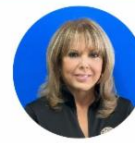
Commissioner Idania Llanio