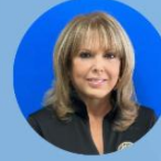
Commissioner Idania Llanio