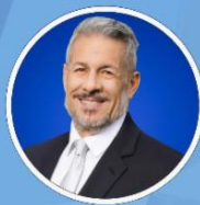
Mayor JOSE "PEPE" DIAZ