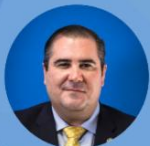
Commissioner Marcos Villanueva