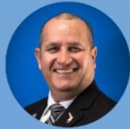
Commissioner Saul Diaz