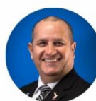
Commissioner Saul Diaz