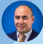
Commissioner Isidro Ruiz