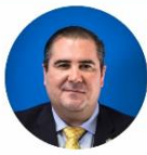
Commissioner Marcos Villanueva