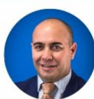
Commissioner Isidro Ruiz